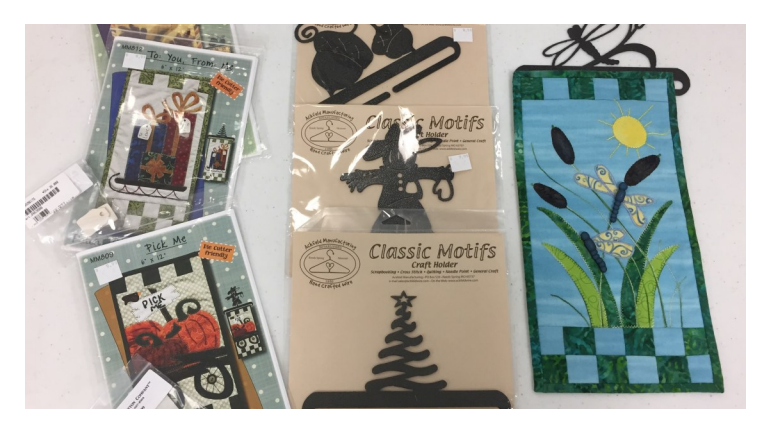
Come see some of the cutest new patterns and accessories to use with them